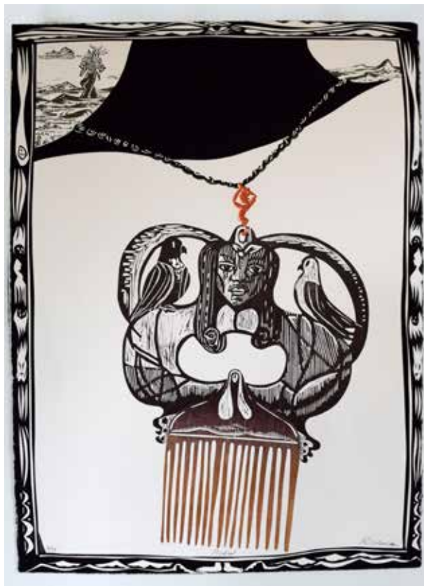
RIGHT: Paula Wilson, Picked , 2016, two-color screenprint and woodblock with foil on paper, 22" x 30". Collection of the artist.

by their generations, unique experiences and physical locations; yet still similarly perma-energized to channel the feelings, emotions, notions, observances and truths in their lives through forms, textures, colors, light and objects.