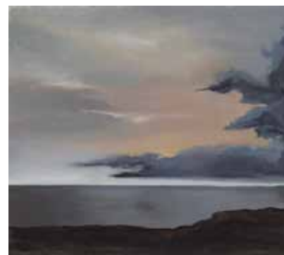
ENCROACHING III OIL ON CANVAS PAPER 18 x 21

450 Harrison Ave., Studio 316B Boston 617 872-0214 SkyPainterStudio.com