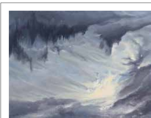
FALLING ICICLES I OIL ON PANEL 30 x 40