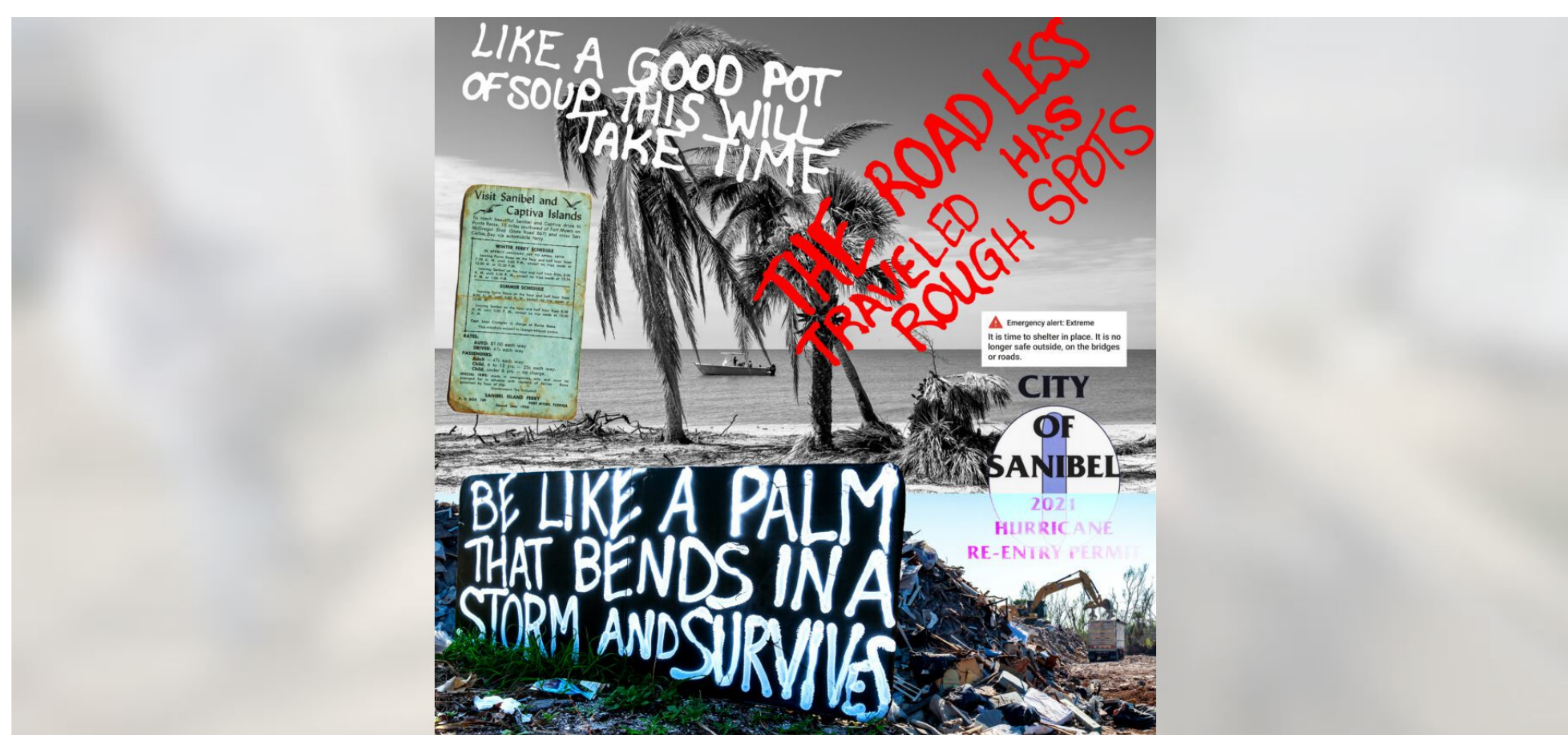
hurricane ian | sanibel island, florida; Eric J. Taubert; fine art photography collage; Aluminum Archival Dye Sublimation (Matte) Print; 24" x 24". PROVIDED